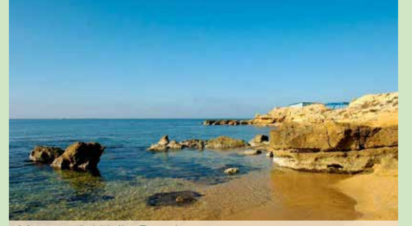
Mazara del Vallo Beach